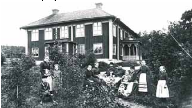
Siggeboda No 1