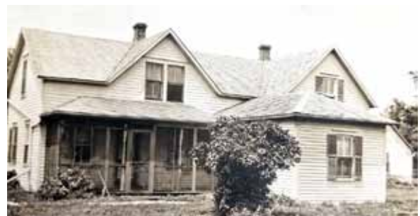
Familt farm ca 1920