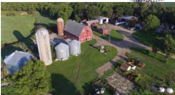
The Family farm 2021